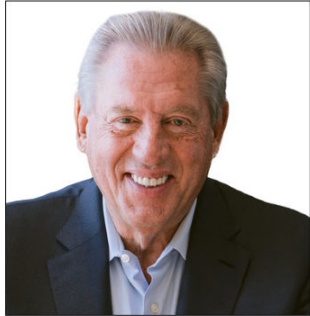
John C. Maxwell

#1 Leadership Expert and Best-Selling Author